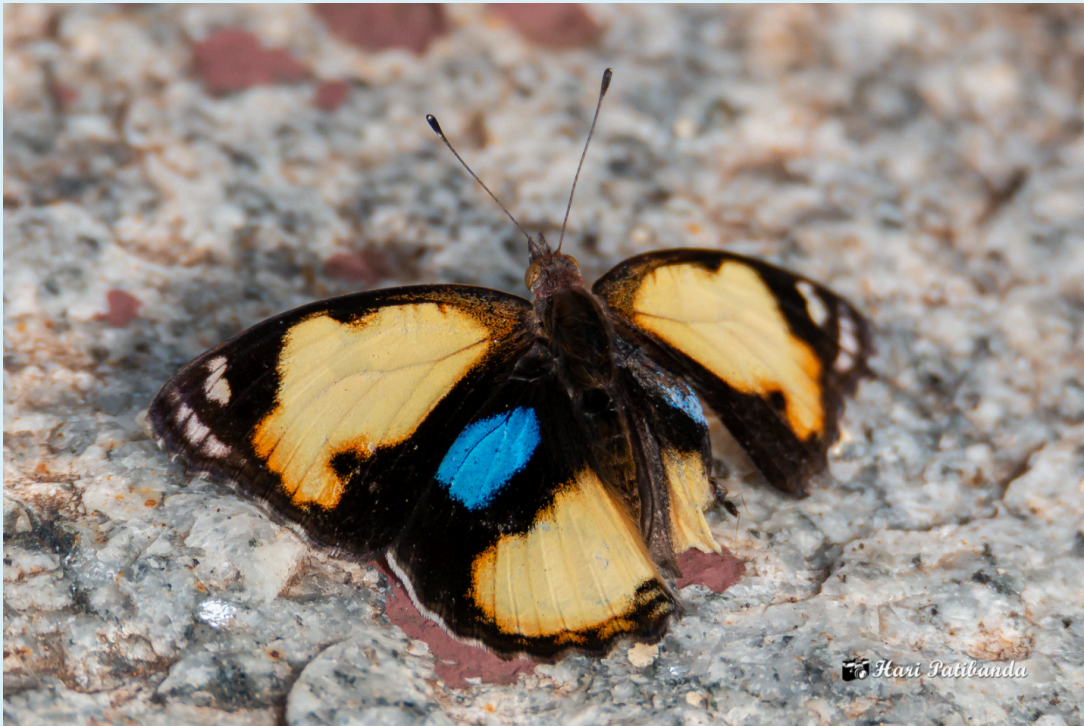
Yellow Pansy Butterfly With a Broken Wing and An Ant

The voices of those whose lives are affected by the decisions governments make should fundamentally inform those decisions. 1